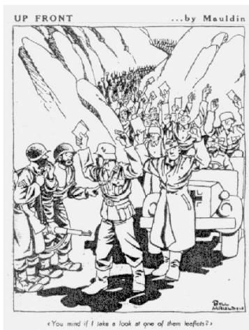
Cartoon by Bill Mauldin, published in Stars in Stripes on Dec. 31, 1943.

End of January (first of two parts) 1944 letters