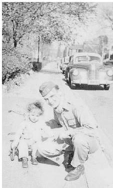
Finally, Dad and daughter...